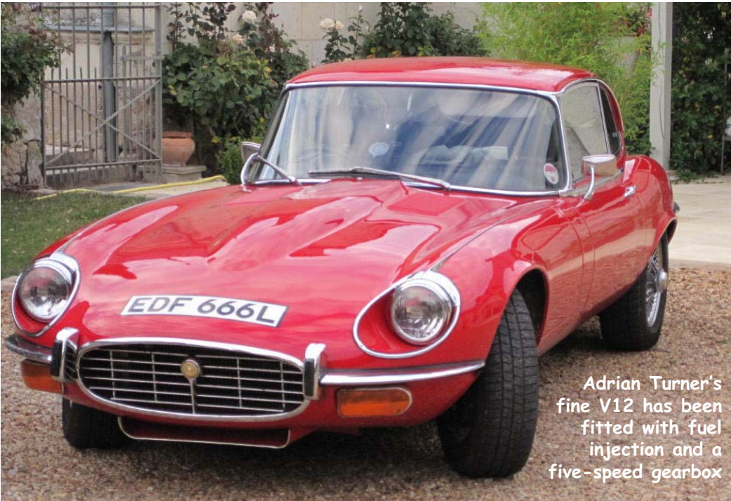
Adrian Turner's fine V12 has been fitted with fuel injection and a five-speed gearbox

than a ferry, simply because it is at least an hour quicker and will give you a more relaxed drive through France and Belgium, to arrive in plenty of time for Signing On. That will be open from 2pm to 6pm; if you're running late, please give us a ring on the rally number and we will work around it – but we do advise arriving by early afternoon if you possibly can, as that will give you time to apply the rally stickers and plates, and start plotting the maps we provide, without any late-night panics.